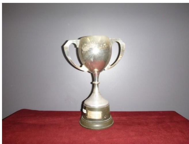
The Stembridge Cup