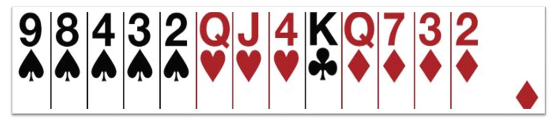
6+ points and no fit in hearts