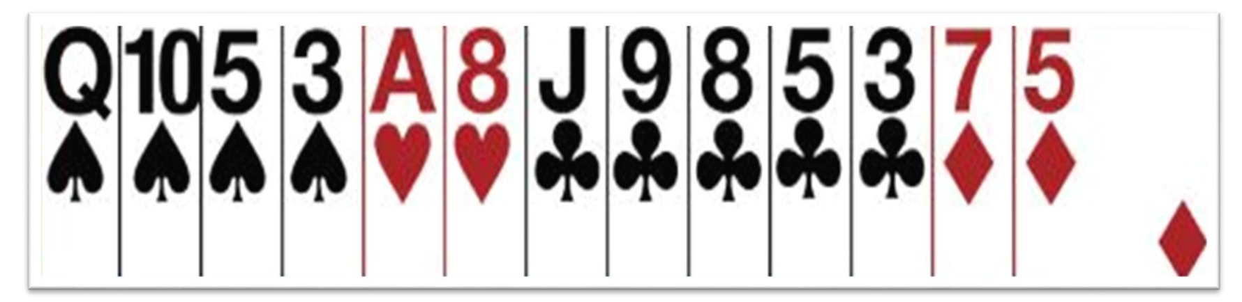
6+ points and no fit in hearts.

Not enough points to bid your longer suit at the 2-level