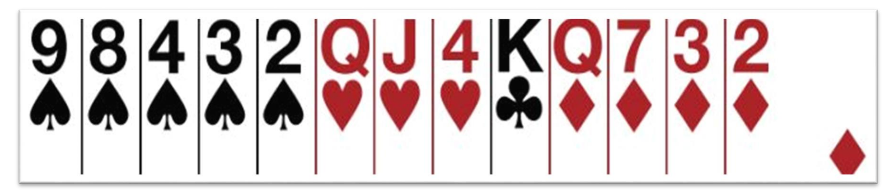
6+ points and no fit in hearts